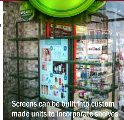
Screens can be built into custom made units to incorporate shelves