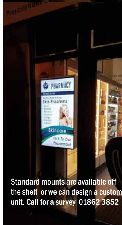
Standard mounts are available off the shelf or we can design a custom unit. Call for a survey 01862 3852